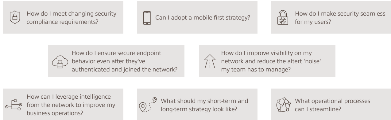
Figure 1. Common questions organizations ask about security.

At Insight, clients come to us with a number of questions. They need answers and we are happy to provide them. Figure 1 gives just a small sampling of the questions we field in the area of network security.